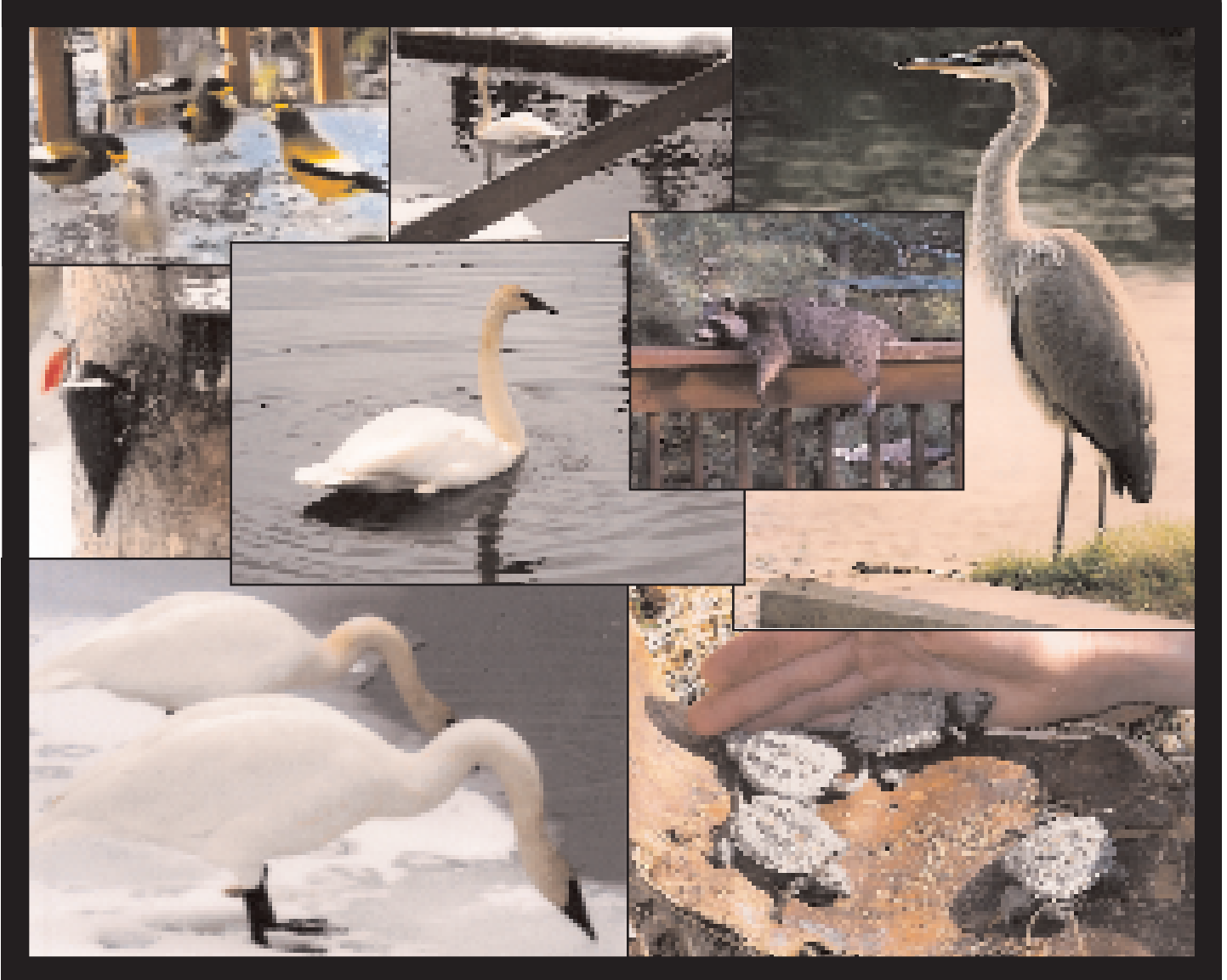
Scenes from Song of the Morning Ranch

"The magnificent painting of creation stretches across the infinite canvas of time and space. Every object, every event in nature is a masterful stroke of the Great Painter." – Paramahansa Yogananda