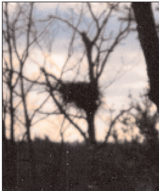
Bald Eagle's Nest, near overlook